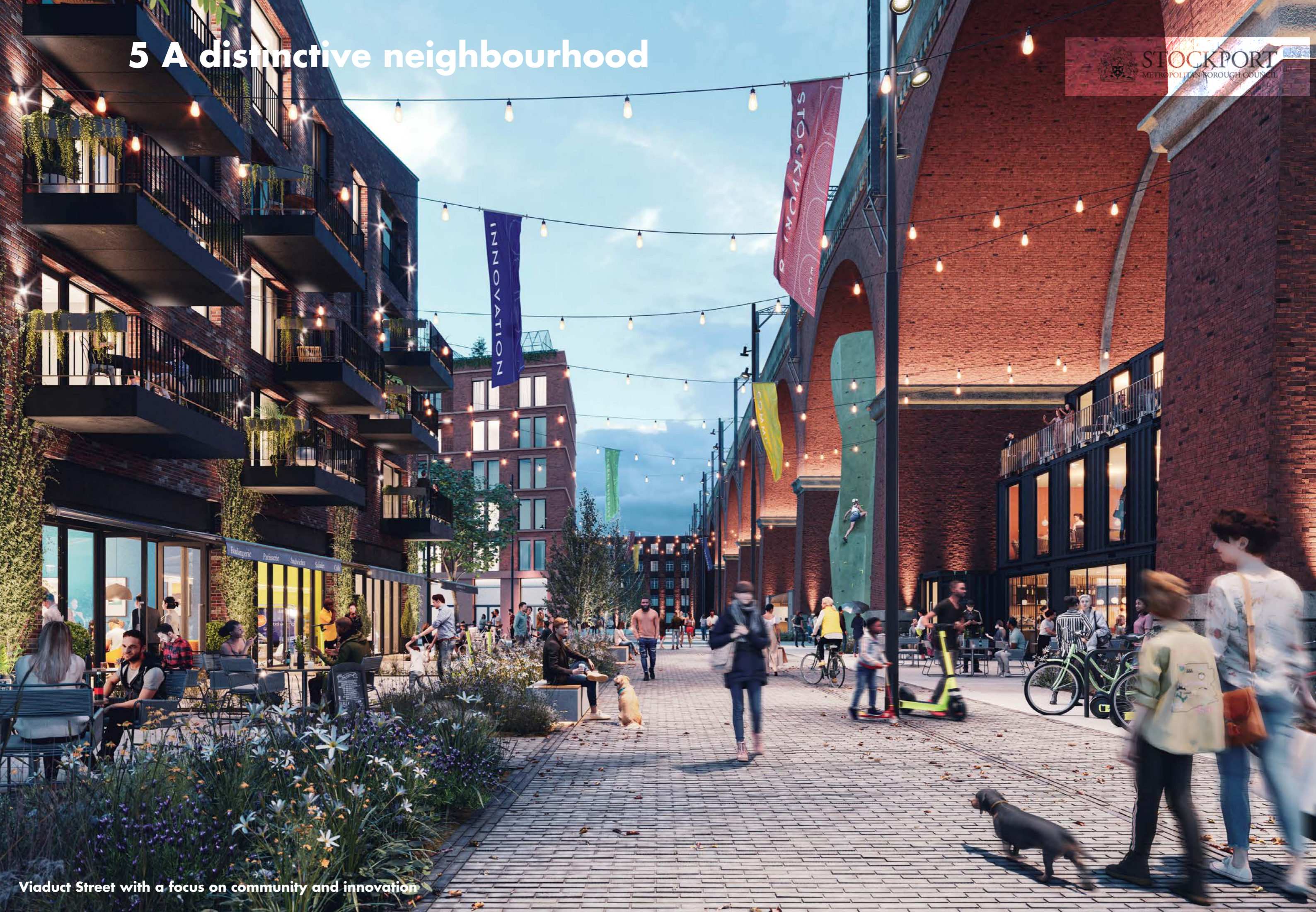
Viaduct Street with a focus on community and innovation