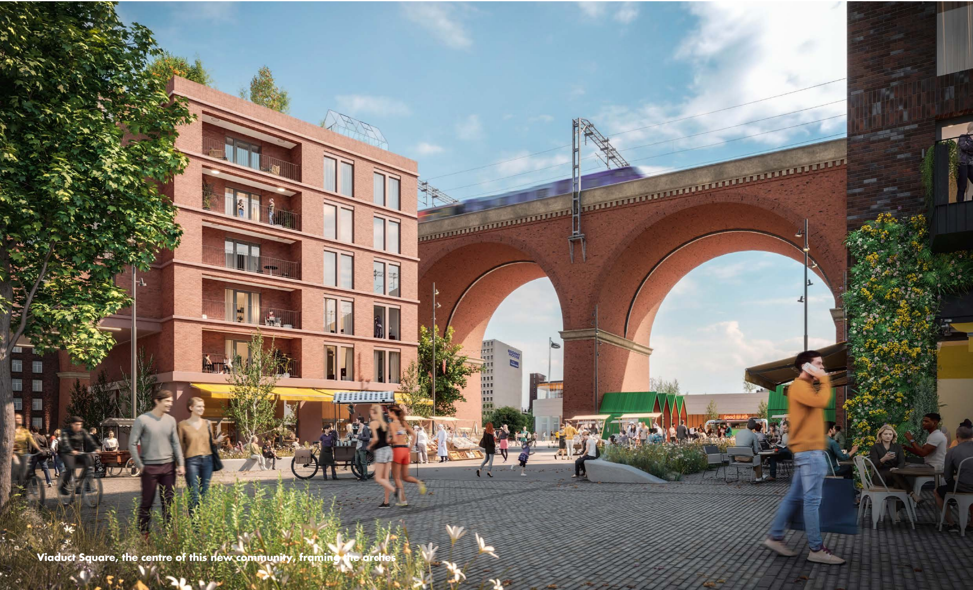
Viaduct Square, the centre of this new community, framing the arches